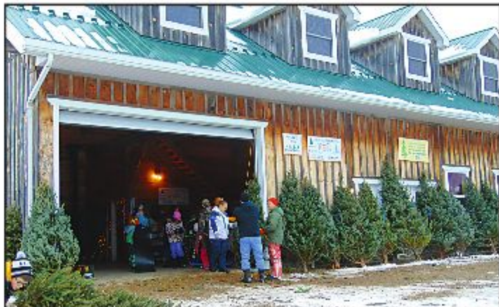
TREE TIME: Madeira's Tree Farm of Rockwood was a buzz with families over the weekend who were looking for that perfect tree for Christmas.