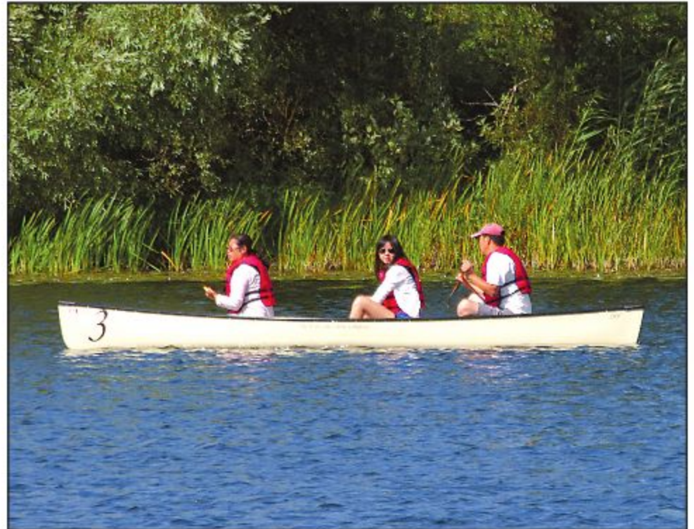
CALM WATERS: Fairy Lake was busy with boaters over the weekend while many decided to take advantage of the cool waters during the hot humid days and rented canoes from the Holy Cow Canoe Rental.