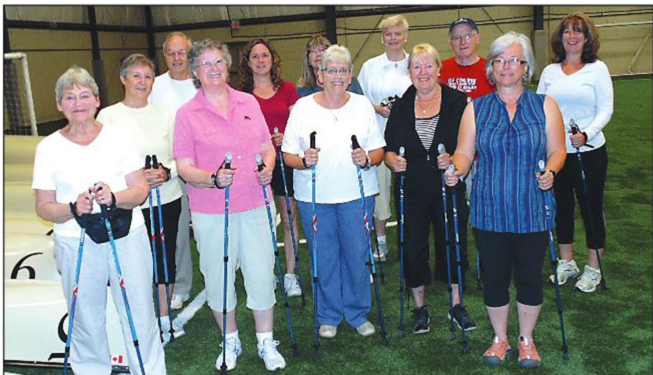
POLE POWER: The physical benefits of Nordic Pole Walking are well-known and the program, offered at the Dufferin Rural Heritage Centre, is growing in popularity.