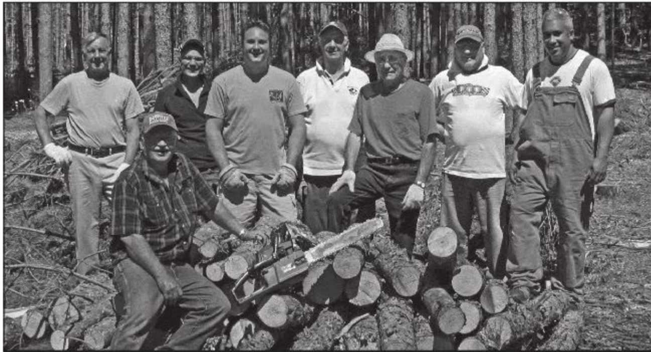
CAMP CREW: Armed with chainsaws, members of the Knights of Columbus, Holy Name of Mary, Council 14201 of Rockwood, recently helped clear downed brush and trees at Camp Brebeuf, a Catholic youth camp in Rockwood.

The fun includes face painting, local crafts, a fish pond, penny table, plant sale and lots of music and food