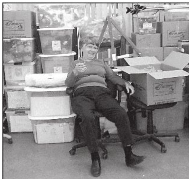
HARD AT WORK? The New Tanner seniors' correspondent survived the wild days of packing and moving - temporarily - to the Boathouse and Acton Legion during renovations now underway at the Acton Seniors Centre.