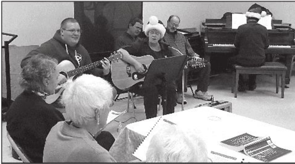
SENIORS SING: Holiday favourites were on the playlist when Rockwood seniors met for their Friday luncheon at the library, led by Sacred Heart Parish musicians.