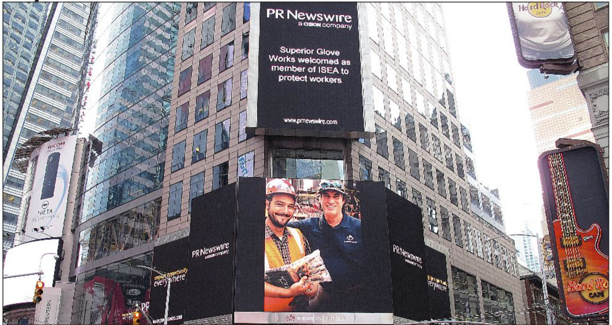
NAME IN LIGHTS: New ISEA member, Superior Glove Works was showcased recently in New York's Time Square.

The International Safety Equipment Association (ISEA), the leading association for personal protective equipment and technologies, and ANSI-accredited standards developing organization, is pleased to welcome