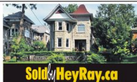
Sold by HeyRay.ca

Honey Stop The Car! That's what you'll be saying when you see this Charleston raised bungalow with walkout lower level, attached 1.5 car garage & 3.5 acre treed lot. Move in & enjoy country living! $699,900.00 Erin MLS#X3575328