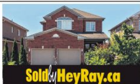
Sold by HeyRay.ca

Charm Of Yesteryear! New in 1898!!! Magnificent, 4+ bedroom, 3 bath century home with all the charm & character of its era, yet updated to today's standards. Gorgeous grounds. Pride of ownership throughout! $699,900.00 Georgetown MLS#W3542405