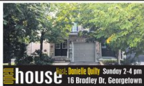
house Host: Danielle Quilty Sunday 2-4 pm 16 Bradley Dr. Georgetown

Doesn't Get Any Better! This lovely 3 bedroom, 2.5 bath end unit townhome, located in desirable Dominion Gardens in central Georgetown. Approx 1,570 sq.ft. of living space - open concept living room & kitchen, separate dining area. Mstr with ensuite, walk-in closet & balcony! Unfinished basement just waiting for your ideas!! 2 car parking, fully fenced yard & single built-in garage. Close walk to parks, schools, shopping & GO transit station. Come see for yourself! Coming Soon Georgetown MLS #NEW