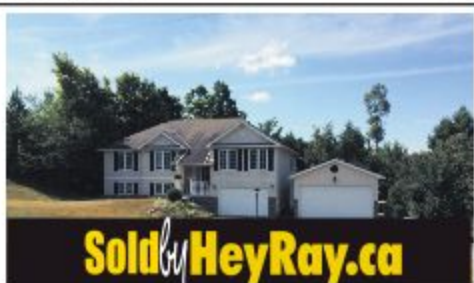
Sold by HeyRay.ca

Bring Your Canoe! Terrific 4+1 bedroom, 4 bathroom family home on a quiet crescent with views over Fairy Lake - no need for a cottage when you live here! Easy flow layout with W/O finished basement. A rare offering! $599,900.00 Acton MLS#W3579020