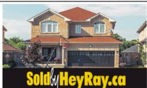
Sold by HeyRay.ca

Entertainers Delight! Exquisite 4 bedroom home with ~3000 + sq.ft. of finished living space. Decorated to perfection with an eye for style & function. Lower level is finished with rec rm, workout area, office/5th bdrm & 3 pc. $724,900.00 Georgetown MLS#W3566365