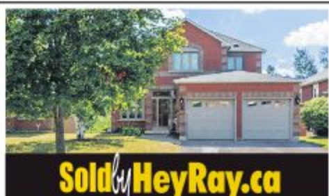
Sold by HeyRay.ca

Lower Level Apartment/Office located in the heart of Downtown Georgetown! Will build to suit - lower level open concept. Possible 2 bedroom, 1 bath apartment OR - professional office - bright & spacious. Great location!!! $1500/month Georgetown MLS#W3536335