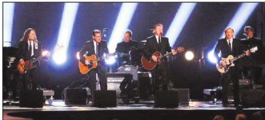
The music of the Eagles (pictured) is celebrated when this incredible show comes to the John Elliott Theatre in Halton Hills