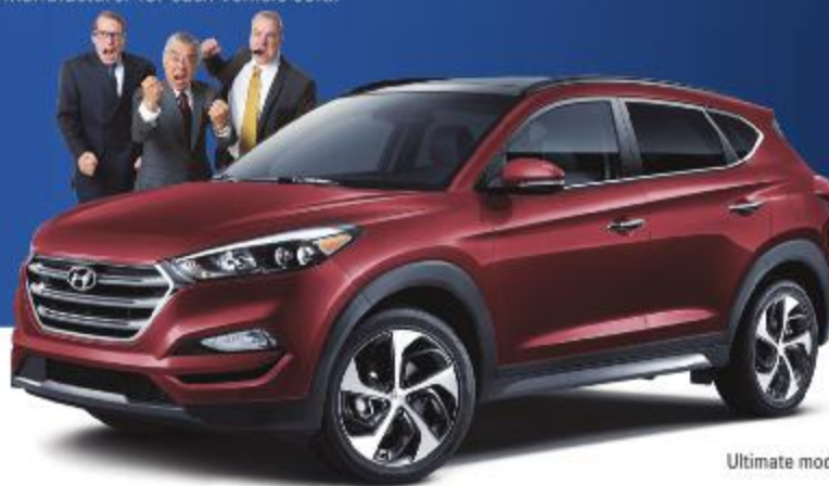
Ultimate model shown*

2.0L FWD INCLUDES: * I I * H H H F * I I I I G H * F G H I H * F $ 3 I K