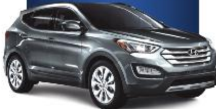
2.0T Limited model shown*