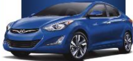
Limited model shown*