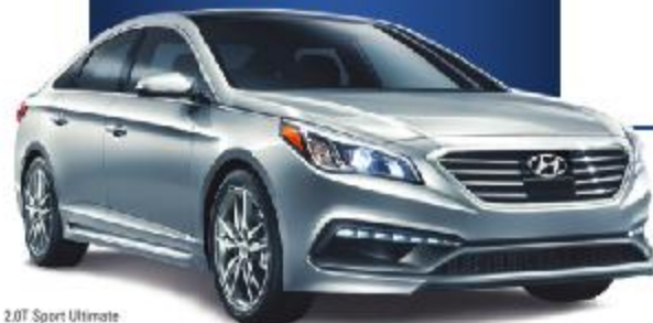
2.0T Sport Ultimate model shown*