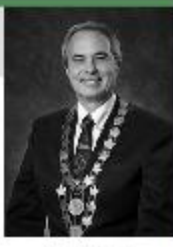
G r y C r r R o n C r

E r n s n p p n n y t a n y o u r s t n s s t o p r p r . F r o M y f t o 7 a H t o n w p r t p t n E r n y P r p r n s s a n o u r n r s n t s t o n o w t r s s n t r o u n t s a p n t o s t y s n t t t t n p t s - s u f f i n t o r 7 2 o u r s . R o n w o r s t o p p r p r r s n t s o r r n s a n y o o r t n w t f i r s t r s p o n r s a o p r t n r s n t o u n t y s w o a w n s u r t t H t o n s r y t o r s p o n n n r n y . o r n o r o u t r n y p r p r n s s a v s t h a l t o n . c a / b e p r e p a r e d .