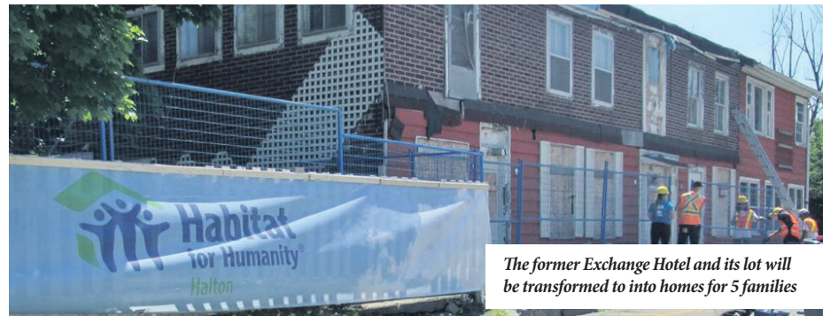
The former Exchange Hotel and its lot will be transformed into homes for 5 families

Habitat for Humanity Halton-Mississauga is looking for local businesses and corporations to sponsor the construction of affordable homes for families in need.