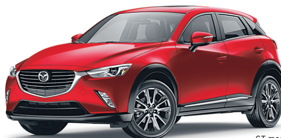
GT models shown

CANADIAN GREEN UTILITY VEHICLE OF THE YEAR