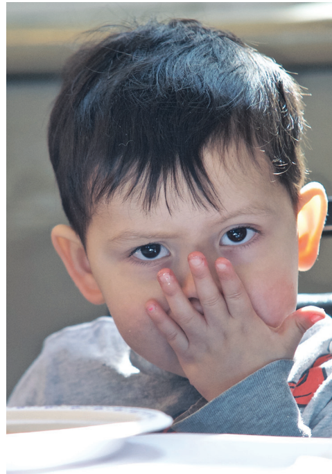
Step 5: Lick every last drop of the sweet syrup from your fingers.