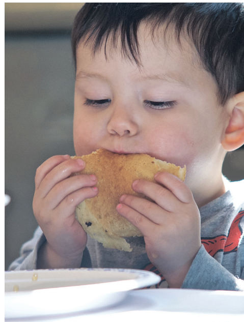
Step 3: Gently bite the artisan delicacy.