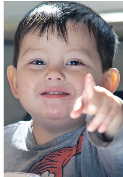
THAT'S how ya do it!