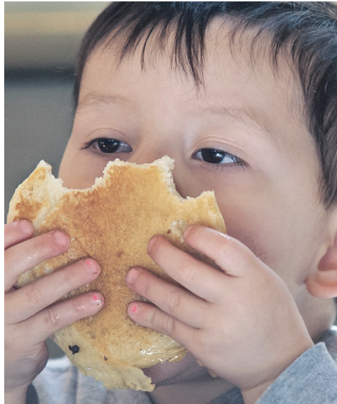
Step 2: Lick the syrup off.