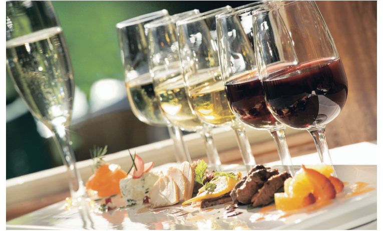
Get tickets for Habitat Halton-Mississauga's Exceptional Evening Out: home is where the heART is on Sat., Apr. 23 at the Crescent Hill Art Gallery in Mississauga.