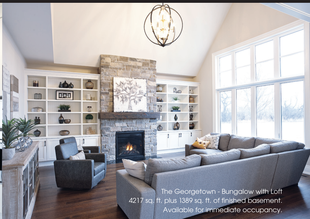
The Georgetown - Bungalow with Loft 4217 sq. ft. plus 1389 sq. ft. of finished basement. Available for immediate occupancy.

Set amidst the rolling hills of highly desirable south Georgetown, lies The Estates of Black Creek. The pinnacle of luxury and classic styling is part of 28 acres of protected greenspace, walking trails & country side vistas. Come take a tour of this community of 20 exquisite homes, minutes from all modern conveniences, shopping, Highway 401 and the GO train.