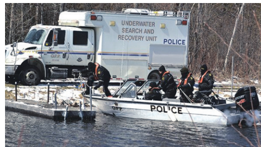
Members of the OPP's Underwater Search and Rescue Recovery Unit search Pigeon Lake for the body of a Halton Hills woman.