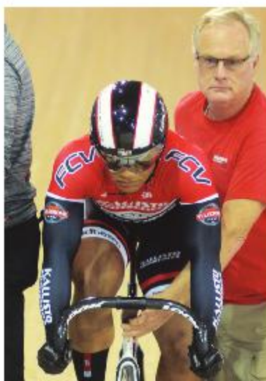
JE LAND SYDNEY