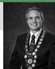
G ry C rr on C r

on Coun s o tt to support n stron n sust n o ono y. On M r 23/ H ton pr s nt t Economic Development Economic Review 2015 st ff r port/ w t st y rs ono t v ty n r st t v op nt. r port out n ss v r y o ps nts/ n u n ow un poy ntr t s n tr nous row n poy nt v op nt. o own o n tron v rs on o t ur port/ or to rn or outw t s H ton r tp to nv st n o us n ss/ v st halton.ca/business .