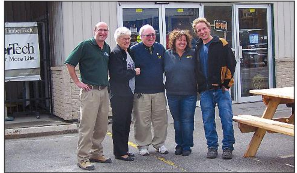
Owners with Wally