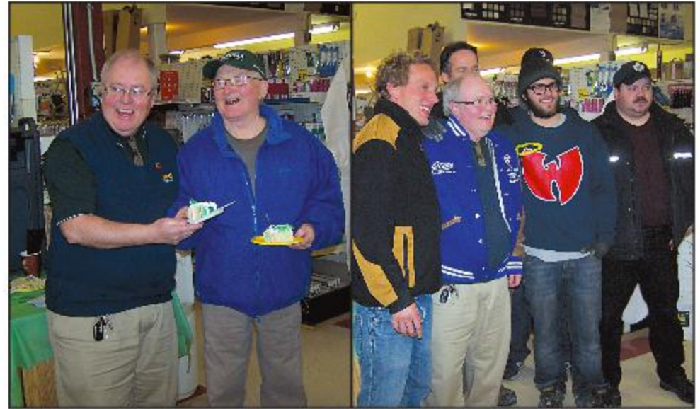
Staff and friends shared cake and stories