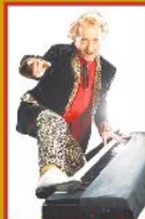
JERRY LEE Lewis