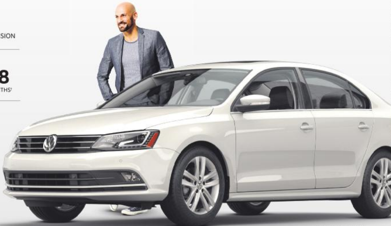
Highline model shown