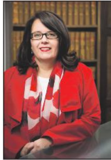
M J min m n

Q: How can I minimize the amount of tax to be paid on my death?