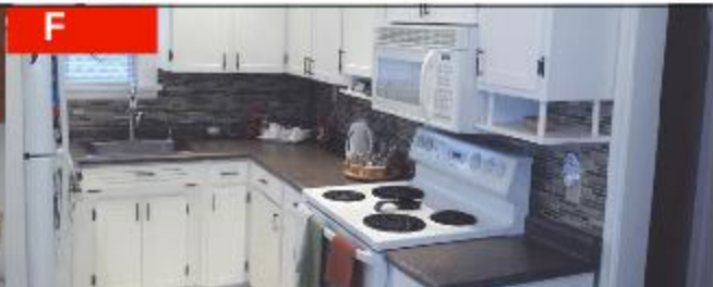
Above: Old Plywood doors converted to shaker style and refinished white. Countertops were updated using one of our Natural Accents! Below: Updated ugly shower in just 2 days!