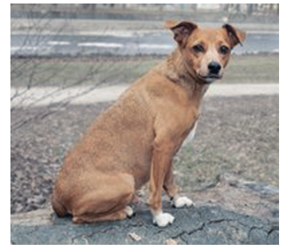
Donations dropped at Global Pet Foods in Acton, 8 Main St. N. between er, visit any Global Pet Foods store Feb. 12-28 will go towards Grand River its inception, the Show Us Your helps animals like Tucker, above, who

To help rescued pets like Tuckfrom Feb. 12-28 to donate. Since All Breed Rescue. This organization Heart™ fundraiser has raised over requires insulin $1,000,000 to help care for thousands of homeless animals across