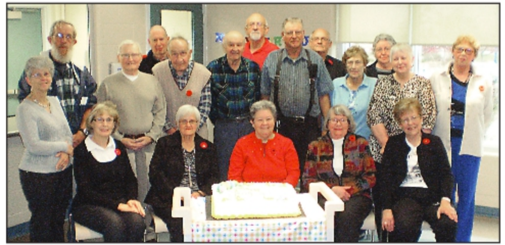
TEA TIME: 18 members of the Hillview Active Living Centre - Acton and their guests met recently to celebrate members with birthdays in November and December.