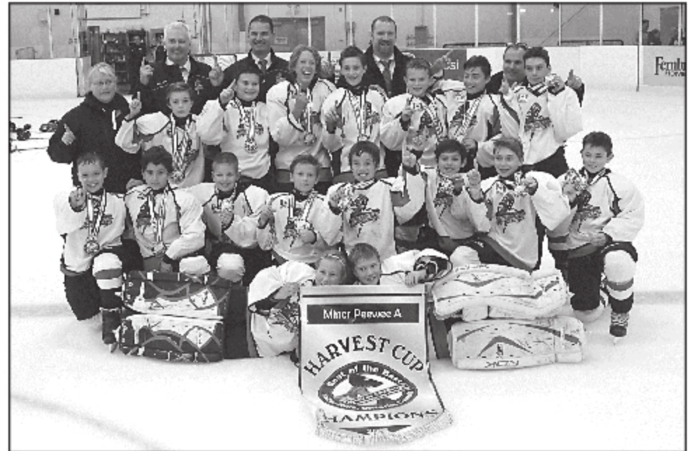
Over Thanksgiving weekend The Halton Hills Minor Peewee A Thunder's impressive four straight shut-outs (Erindale Spitfires 5-0, Credit Valley Wolves 3-0, Welland Tigers 3-0, Credit Valley Wolves 3-0) earned the tournament hosts a rematch in the final against The Welland Tigers. The Tigers came to win and pressed hard going up 1-0 trading goals with the Thunder until it was 2-2. Ultimately Welland's persistence was no match for Halton's commitment to teamwork as the Thunder were able dramatically burry two late goals in the third and win Halton Hills "Best of the Best" tournament 4-2.

Other items on the agenda that evening included the sole-sourcing of a sidewalk plow for Rockwood, as the current plow is wider than some sidewalks. A more appropriate wheelbase width of 44" is required.