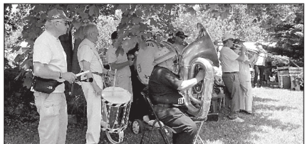
Members of the Canadisi band came out to play at the tree dedication on Sunday.