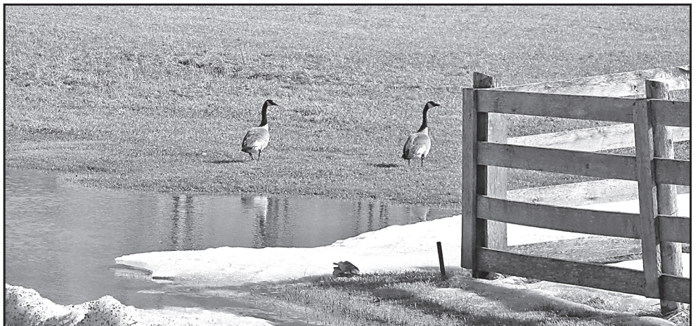
MINI LAKE: These geese found a spot to bathe in, where the sun and milder temperatures have loosened winter's grip enough to create a mini lake.