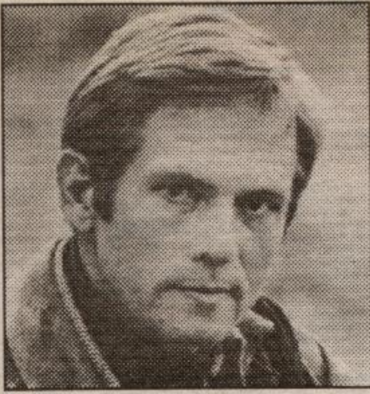
THE IDEAL CHRISTMAS GIFT!

A RARE OPPORTUNITY TO MEET ROBERT BATEMAN