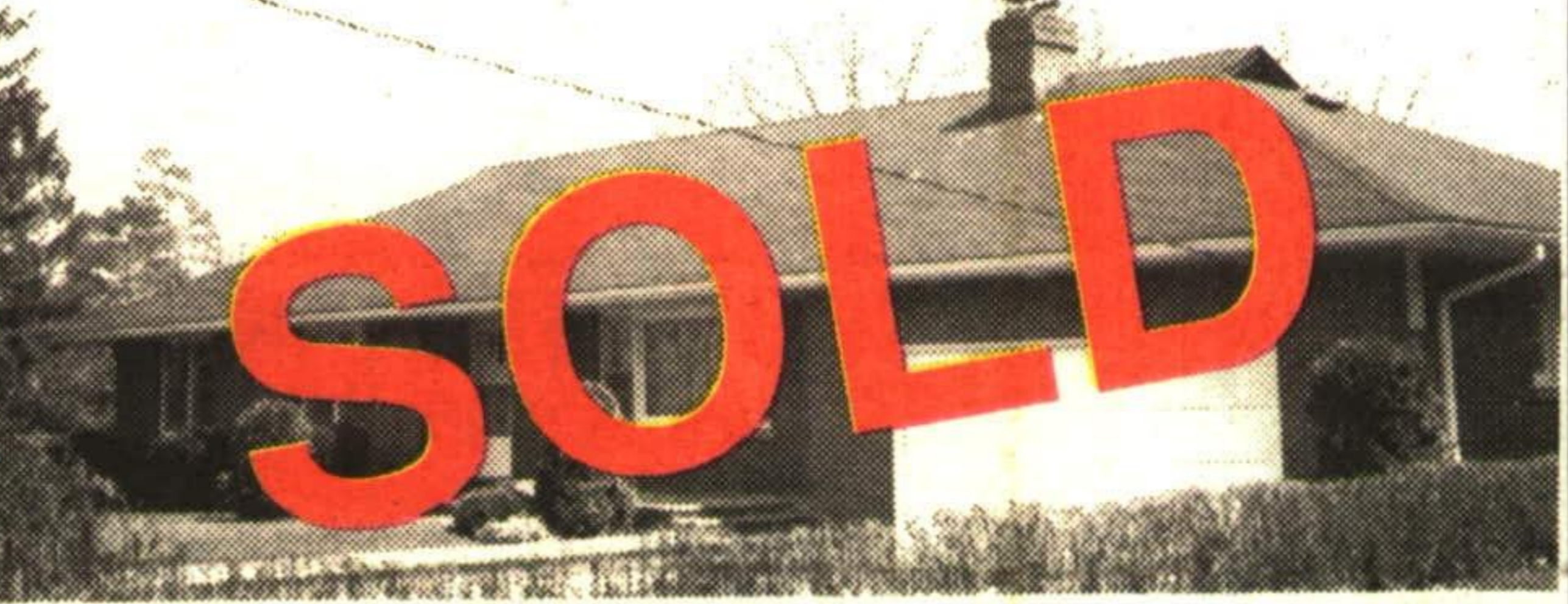
PARK AREA RANCH BUNGALOW