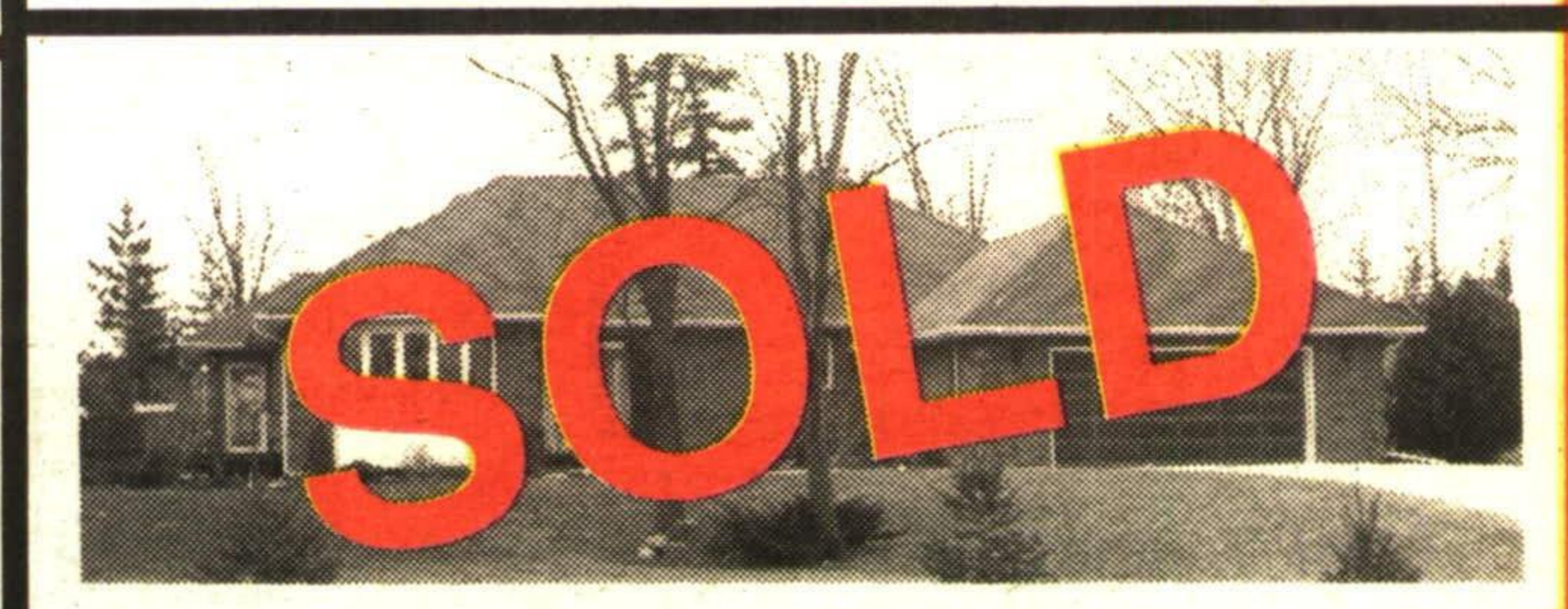
CUSTOM BUILT LUXURY