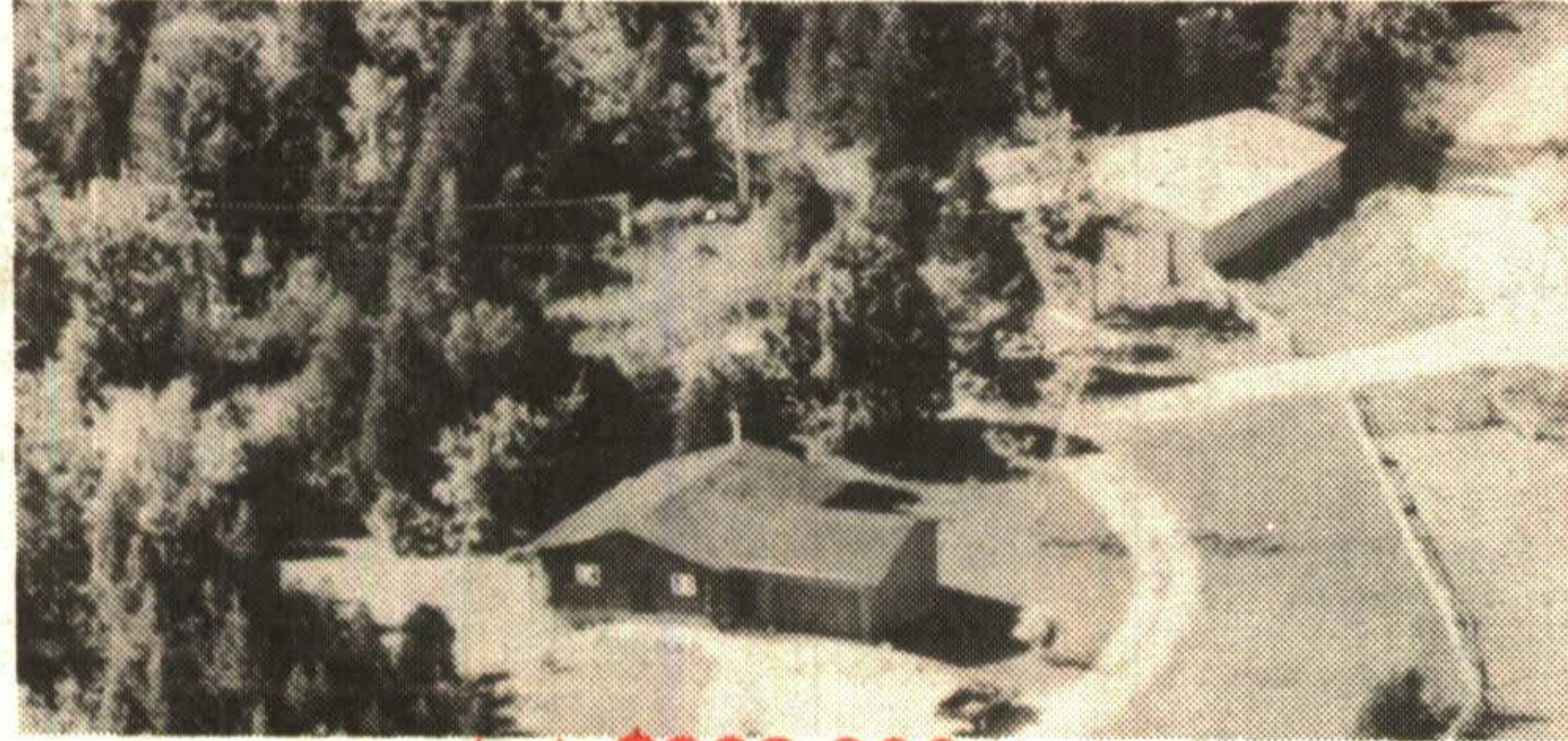
★★ $328,000★★ 55 ACRES - POND - BARN

2400 sq. ft., spacious open concept home, loaded with extras plus attic loft for your imagination plus in-law suite and 2 car garage. Call Anne Genoe** 853-1505 or 877-5211. RM308-94