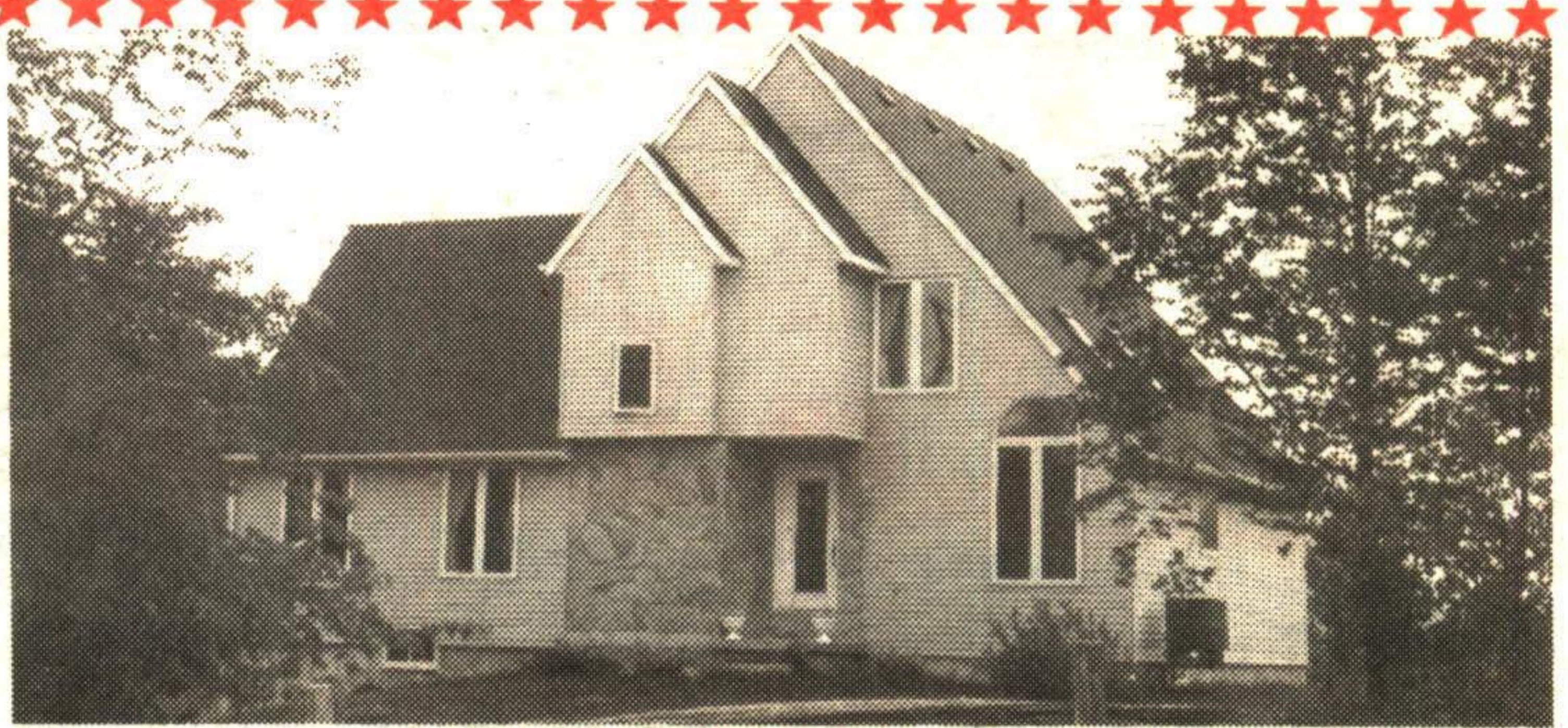
★★ $259,000★★ TRUE BLUE COUNTRY

with 4 bedroom bungalow situated within 1 hour of the airport. Call Anne Genoe** 877-5211 or 853-1505. RM367-94