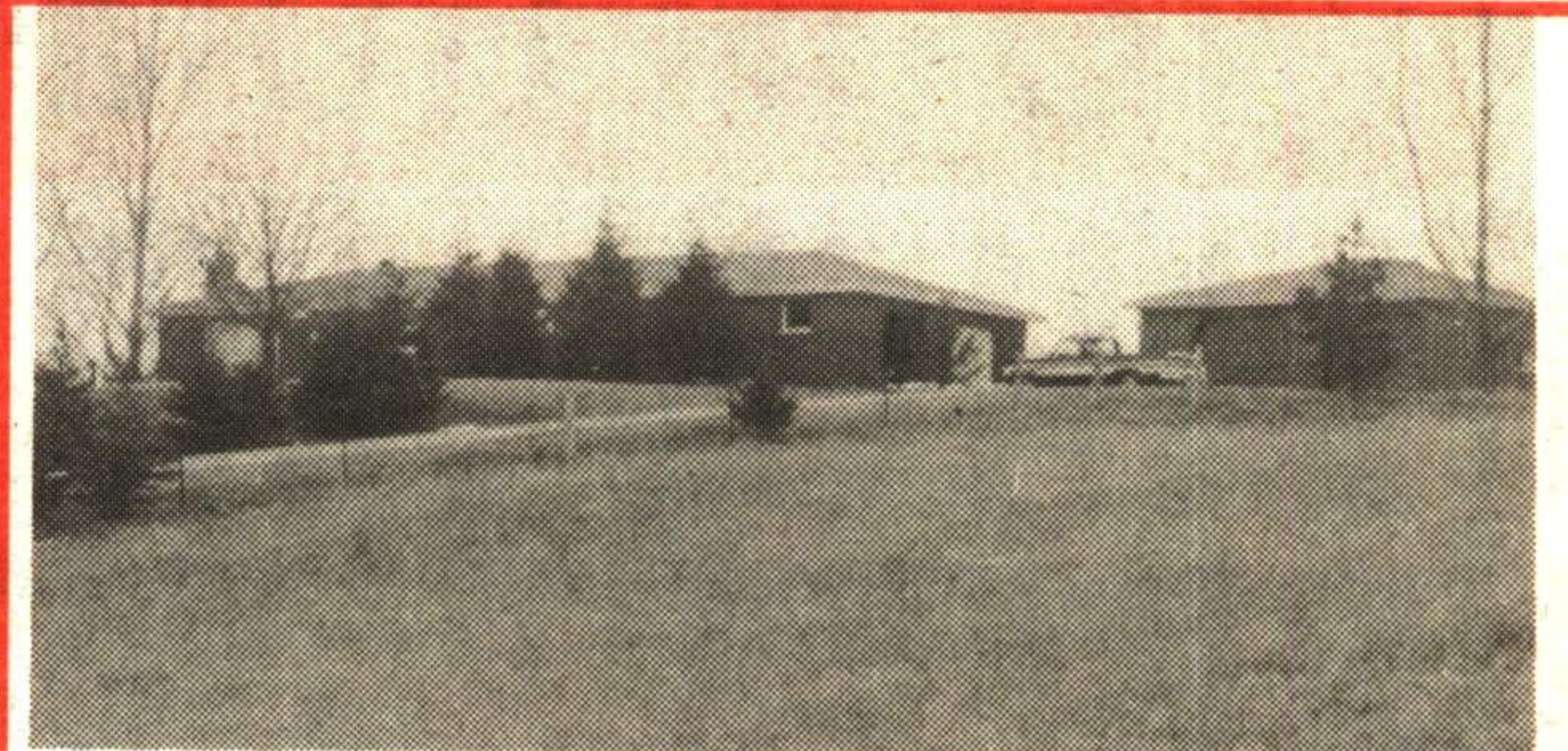
★★ $269,900★★ TRUCKERS! CAR BUFFS!

for qualified purchaser to assume goes along with this spotless bungalow, done up to the "Nines" and situated on extra large lot in town. Call Anne Genoe**. RM165-94