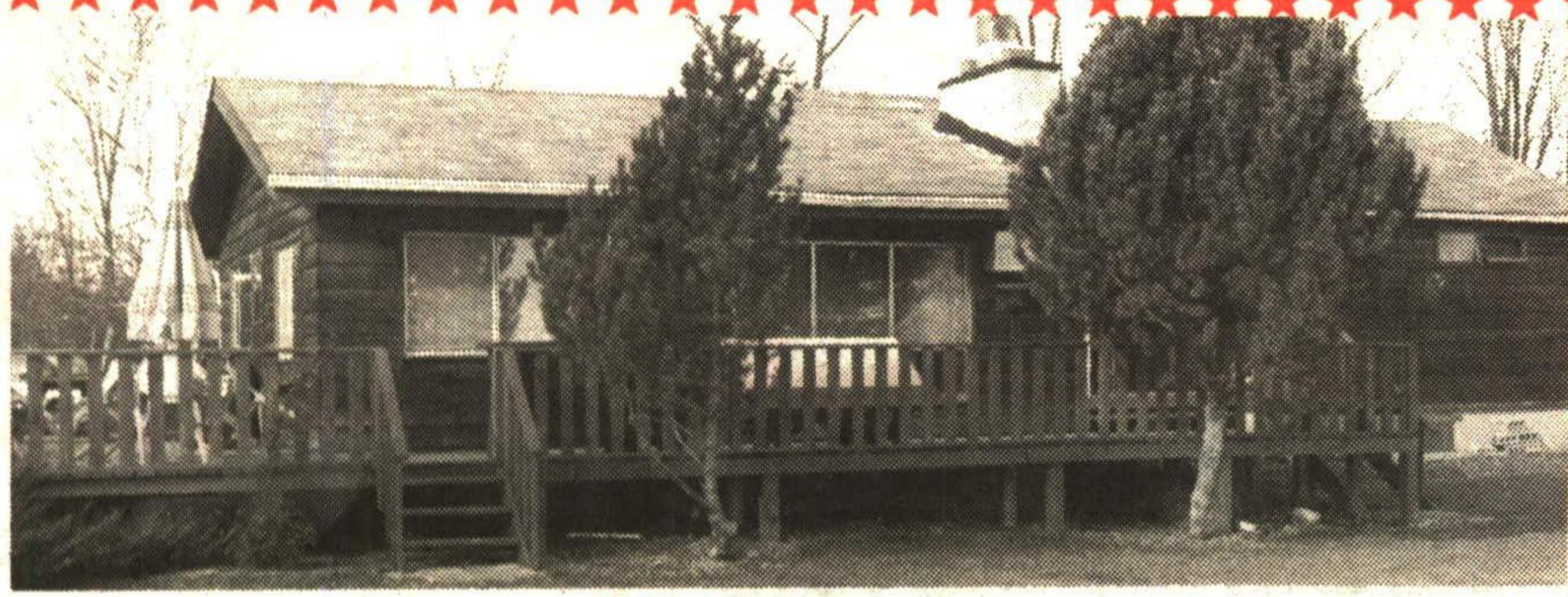
★★ $218,000★★ 30 ACRE HIDE-A-WAY

with 4 bedroom bungalow situated within 1 hour of the airport. Call Anne Genoe** 877-5211 or 853-1505. RM367-94