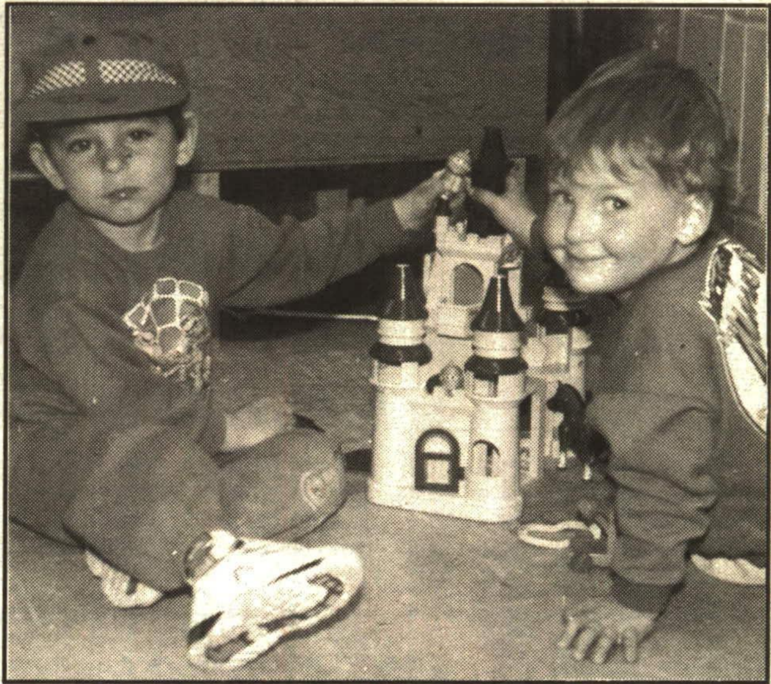
Two young patrons of the Toy Lending Library.