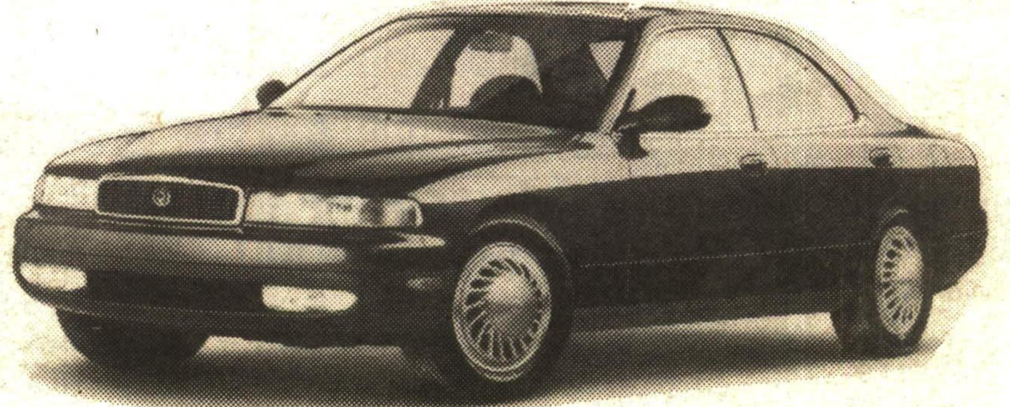
NEW 1993 929 SERENIA