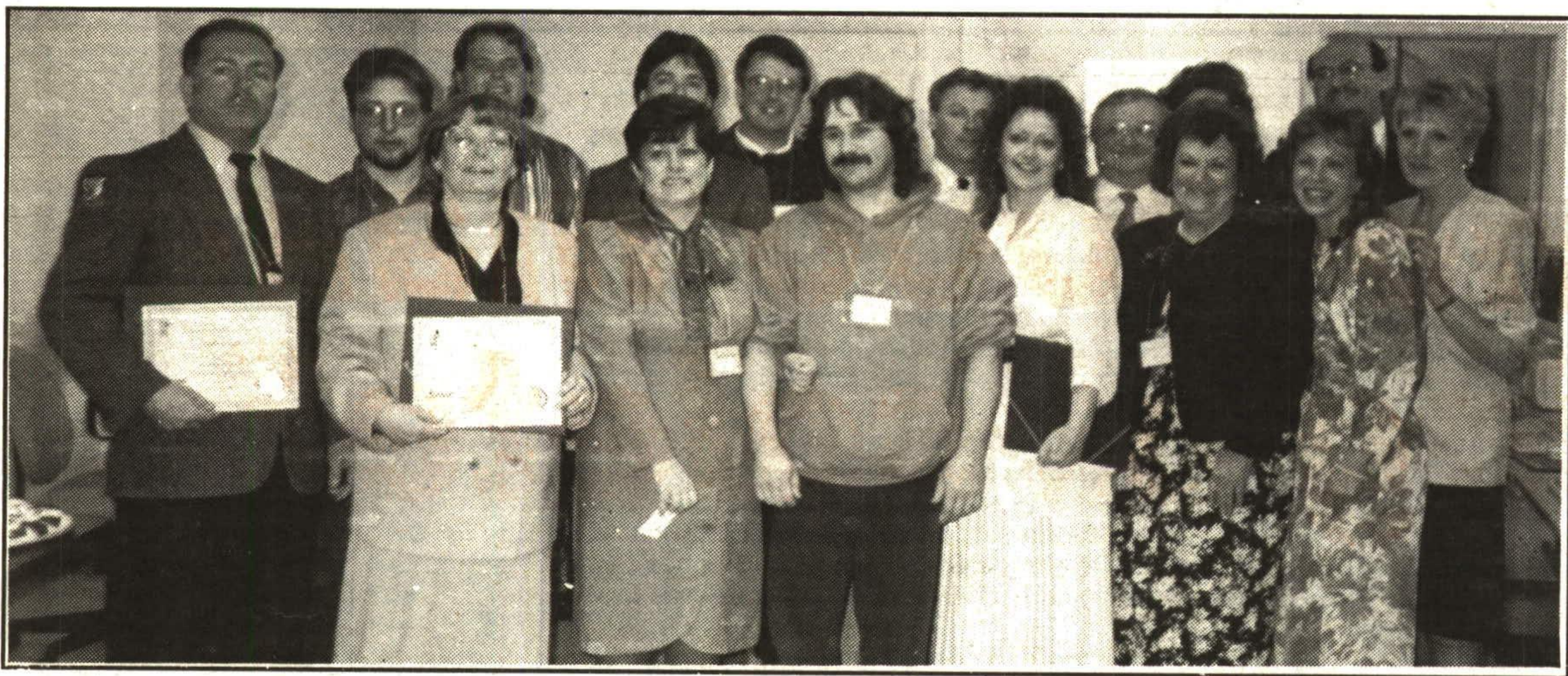
The Entrepreneurship Centre's business development program graduates pose for a group photo prior to their graduation ceremony. Most of the students will be starting their own business within the next six months.