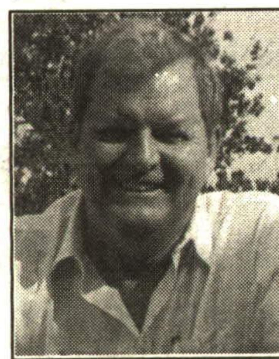
Buzz Currie House & Home Inspections 877-9475

This Seminar is FREE! Call 877-4667 to reserve your space today!