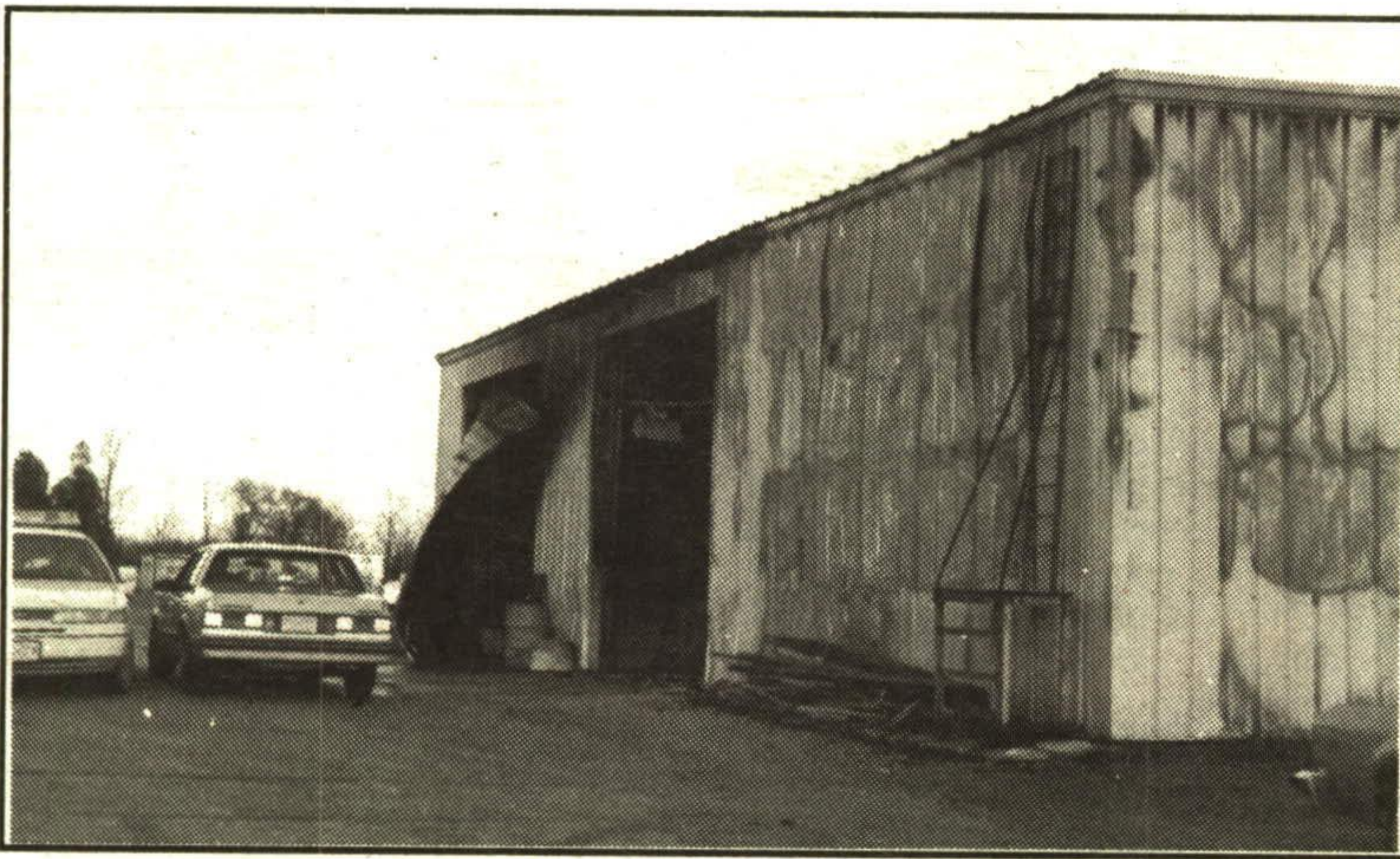
An Acton company, Jet Industrial, was destroyed by fire on Wednesday afternoon when a propane cylinder exploded. The owner of the building was treated for burns to his hands and face.

A date book was left behind on the front seat of a car which someone attempted to steal Tuesday evening. The car was parked at the car pool lot on Hwy. 401 and Trafalgar Rd. A window had been smashed and the steering column was broken, police said. There wasn't any suspect information in the date book, however.