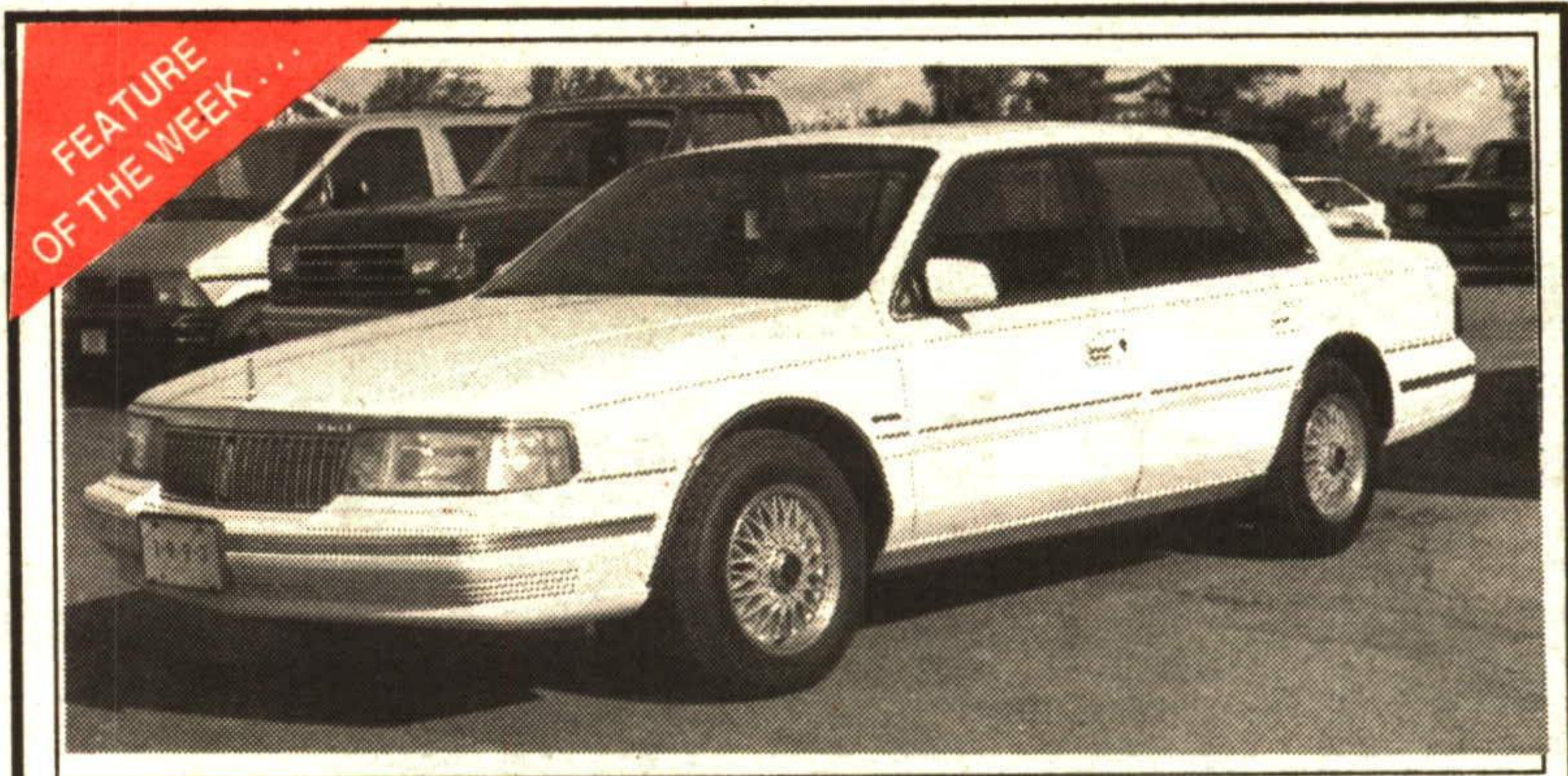
1993 LINCOLN CONTINENTAL Signature Series. Loaded. Stk. #P1648