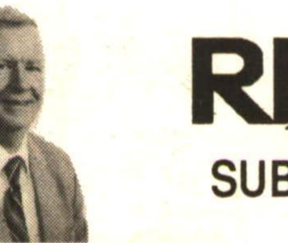
AB GENOE Sales Rep.