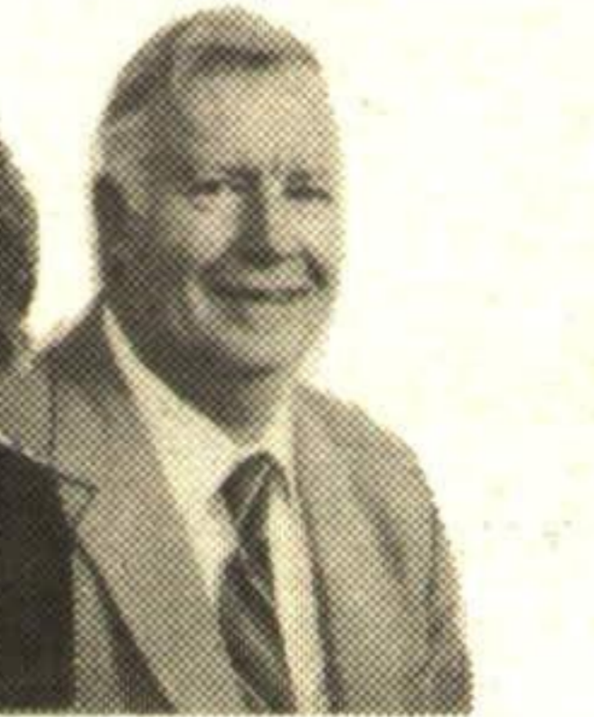
AB GENOE Sales Rep.