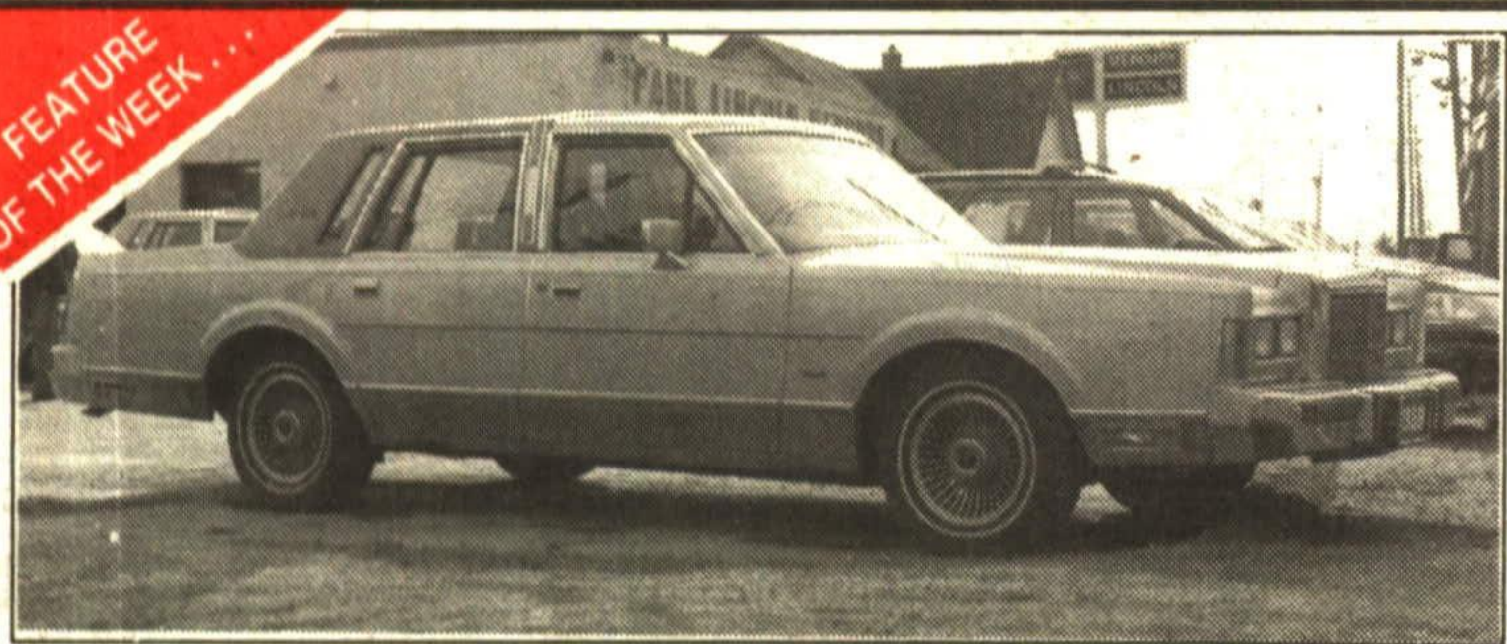
1989 LINCOLN TOWN CAR SIGNATURE SERIES

One owner! Real clean! Ready for Florida? This car knows the way! Has spent every winter there. Stk. #P1620