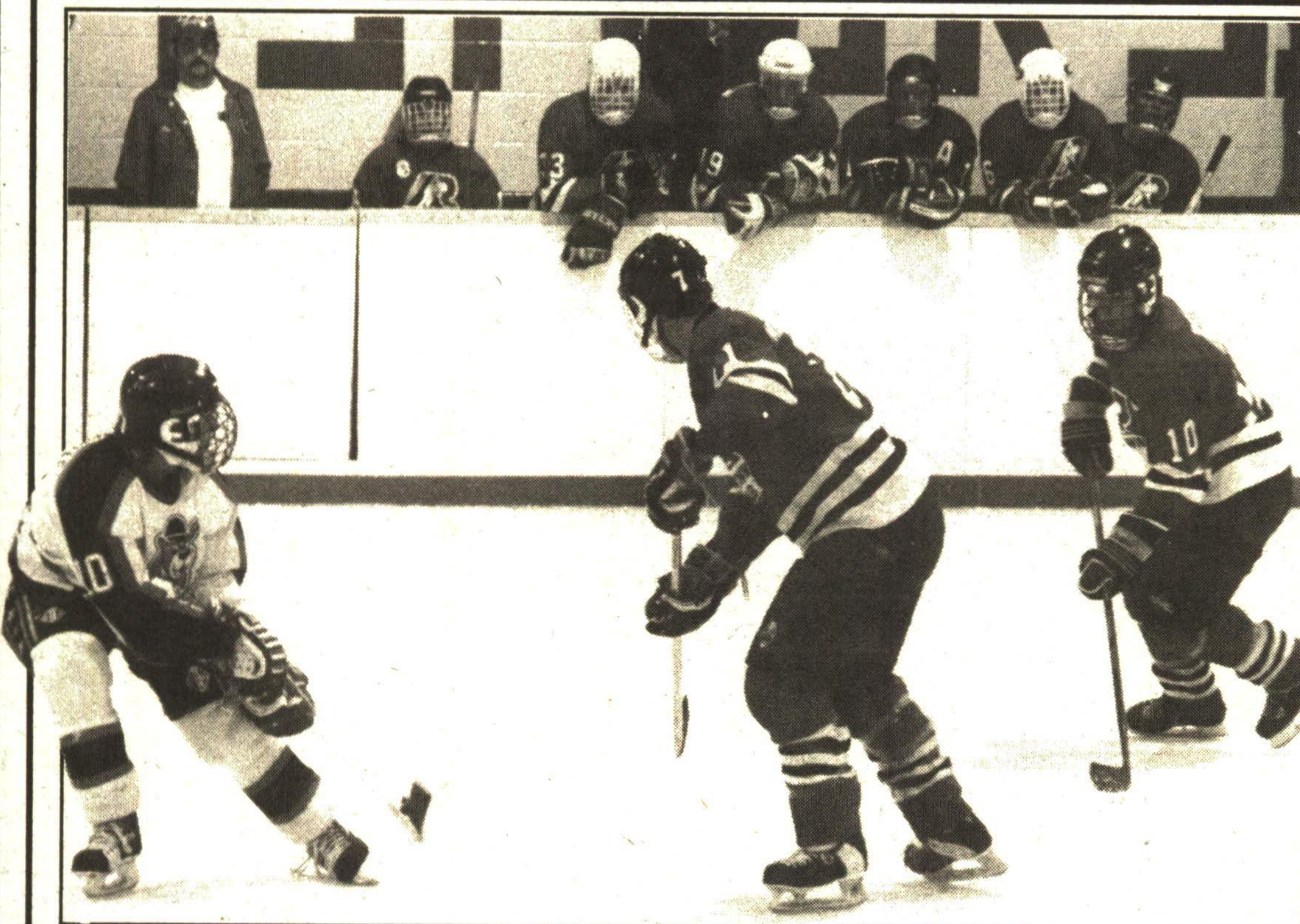
The Georgetown Chrysler Raiders opened training camp this week, following a successful trip to the OHA/NHL tourney in Etobicoke last weekend. The Raiders have inked nine players for the coming season.

It also helps when referees look after the ball players in particular. These are the players who concentrate on skills of the game rather than the physical stuff. Playing physical is all right as long as it is inside the rules and not outside. Referees must protect the clean players and punish the unclean. Otherwise players take to 'policing' by their own methods and chaos often results. Of course, players should play clean in the first place.