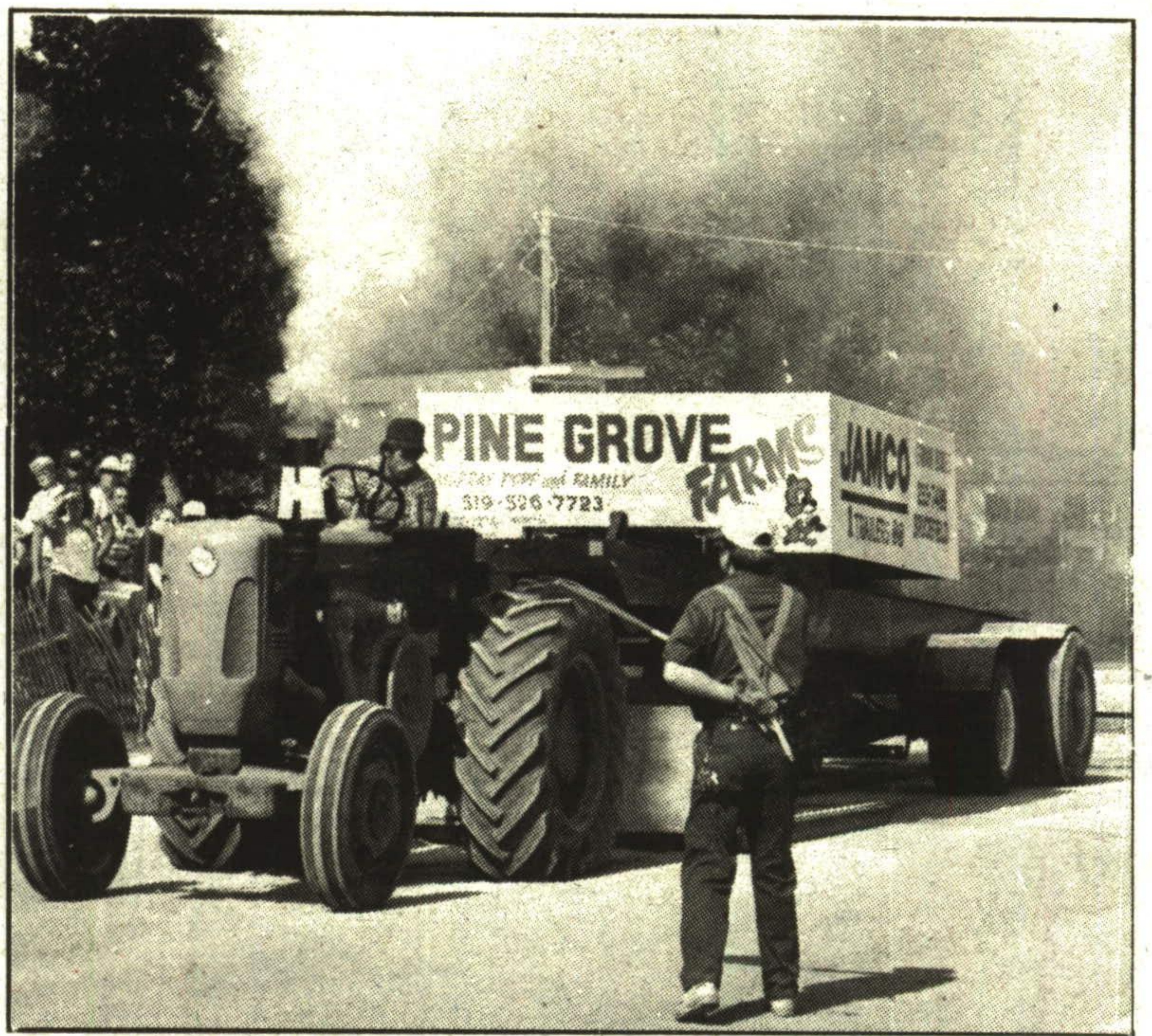
The ever-popular truck and tractor pull will invade Prospect Park again this year for the annual Acton Fall Fair. The event will get under way at 1 p.m. on Sunday, September 19.

The popular 4X4 Trucks join in when the weight being pulled reaches their range of capability.