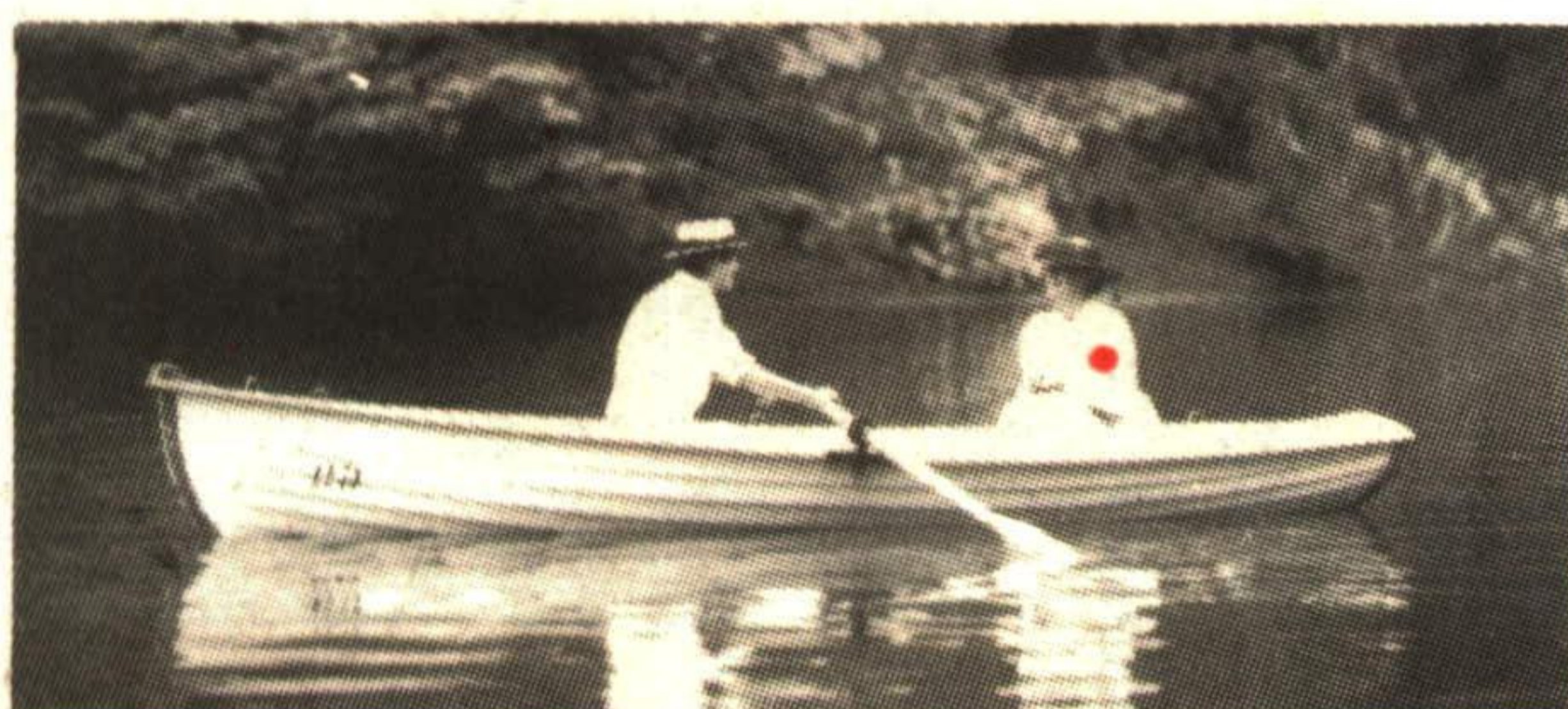
Views from your window reveal the Millpond and the Niagara Escarpment.

This week discover what true carefree living is all about - Discover Village Parc in Milton, minutes from Mississauga yet worlds apart. Here you'll appreciate the remarkable convenience of easy Toronto accessibility, plus the advantage of true year round natural recreational amenities set within the charm of Downtown Milton.