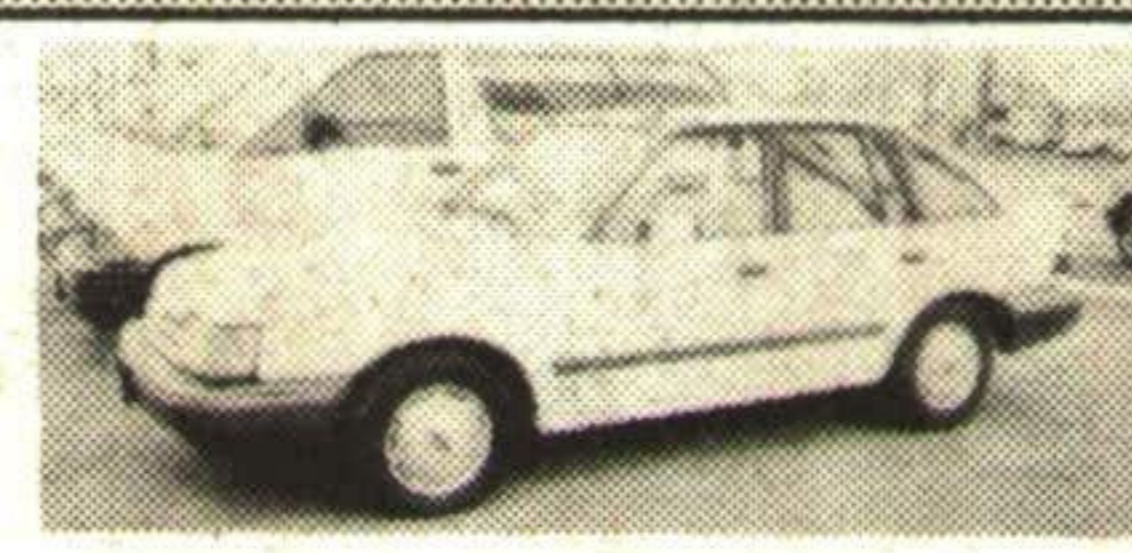
1990 ESCORT HATCHBACK Air, auto, very clean. Stk.#9328 $6,995.