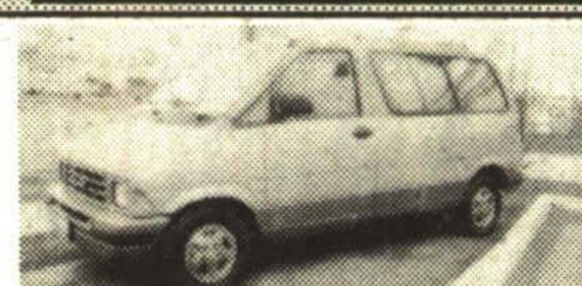
1991 AEROSTAR XL 7 passenger, air, auto, decor group console. Stk.#9350 $14,690.