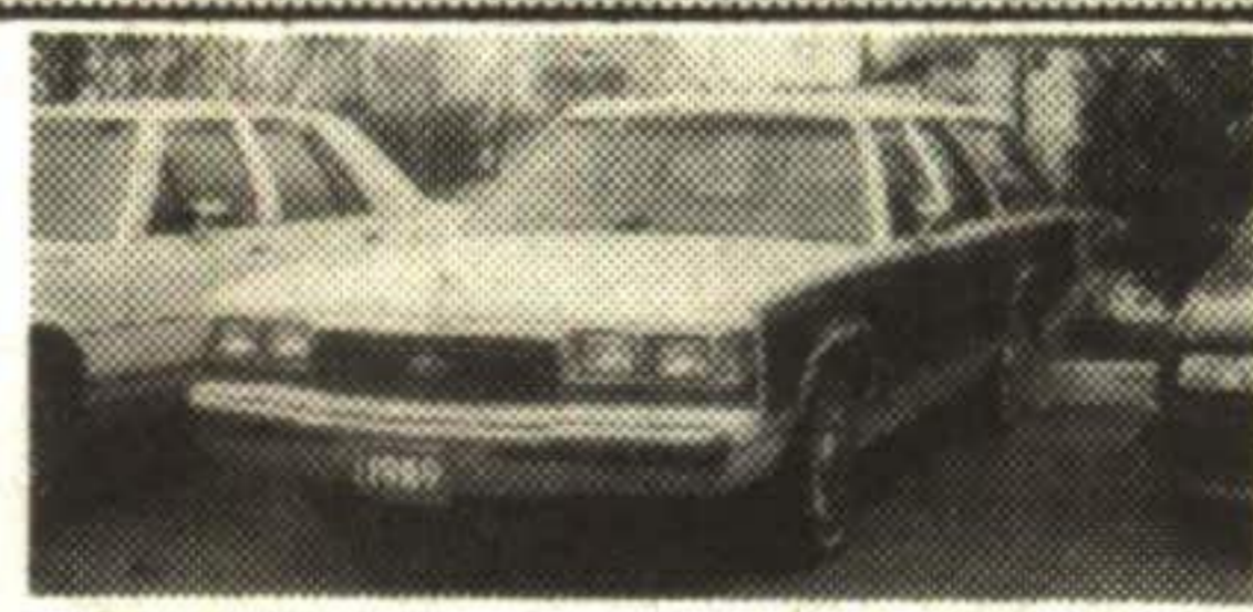
1989 COUNTRY SQUIRE WAGON V8, auto, air, AM/FM cassette. Stk.#A8340A $6,995.