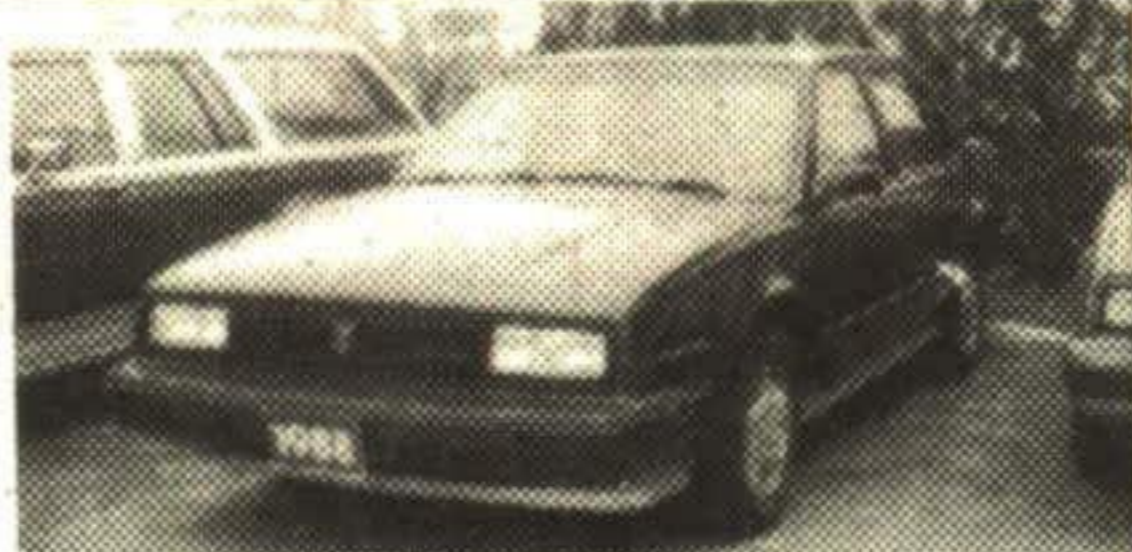
1988 PONTIAC 6000 SE Air, auto, power locks & windows. Stk.#A8321A $5,995.