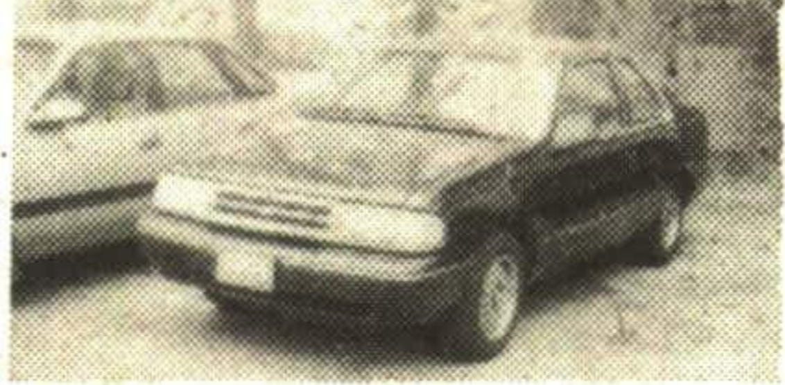
1991 TEMPO L Auto, air, Very clean. Stk.#92128 $7,295.