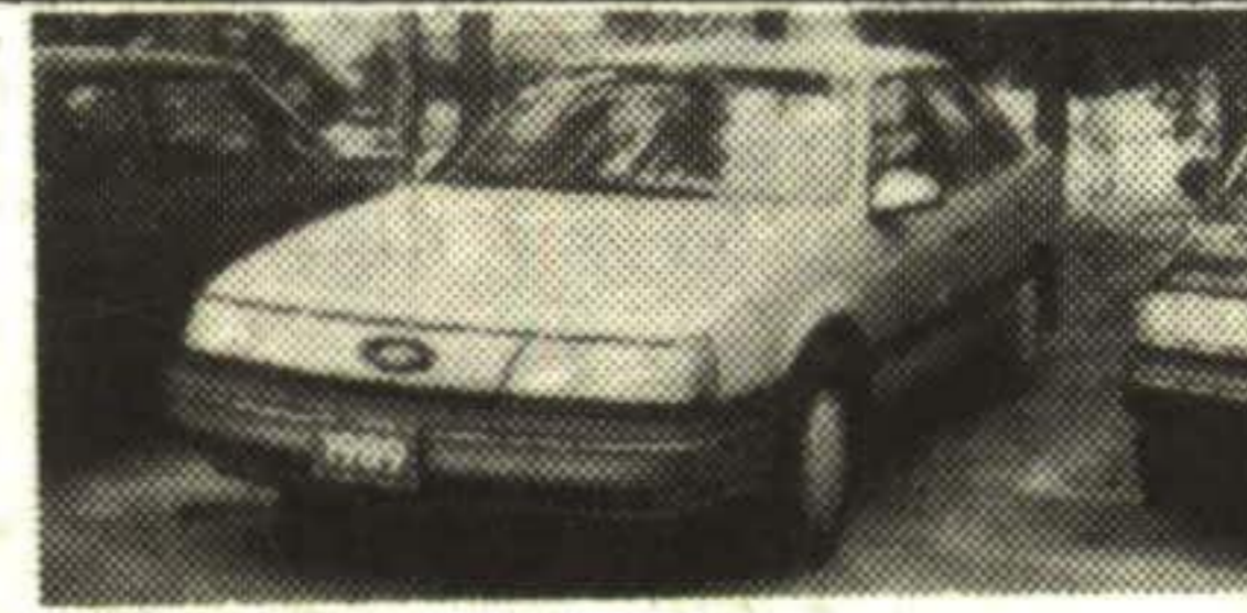
1989 TAURUS L Auto, air, AM/FM cassette. Stk.#92148 $6,695.