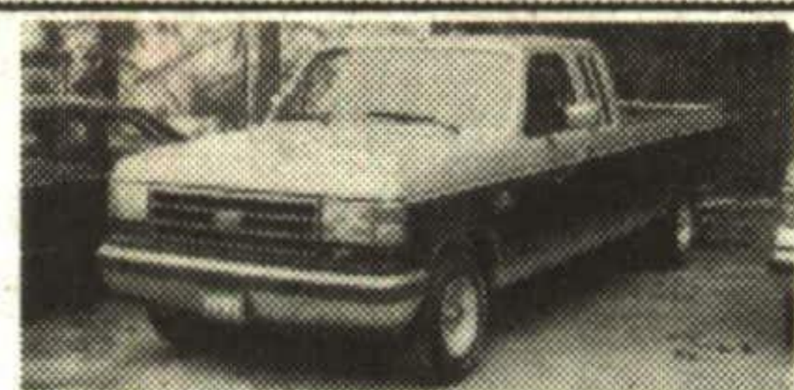
1991 F150 SUPER CAB XLT Loaded, 2 tone paint, box liner, and much more. Stk.#82184A $15,295.