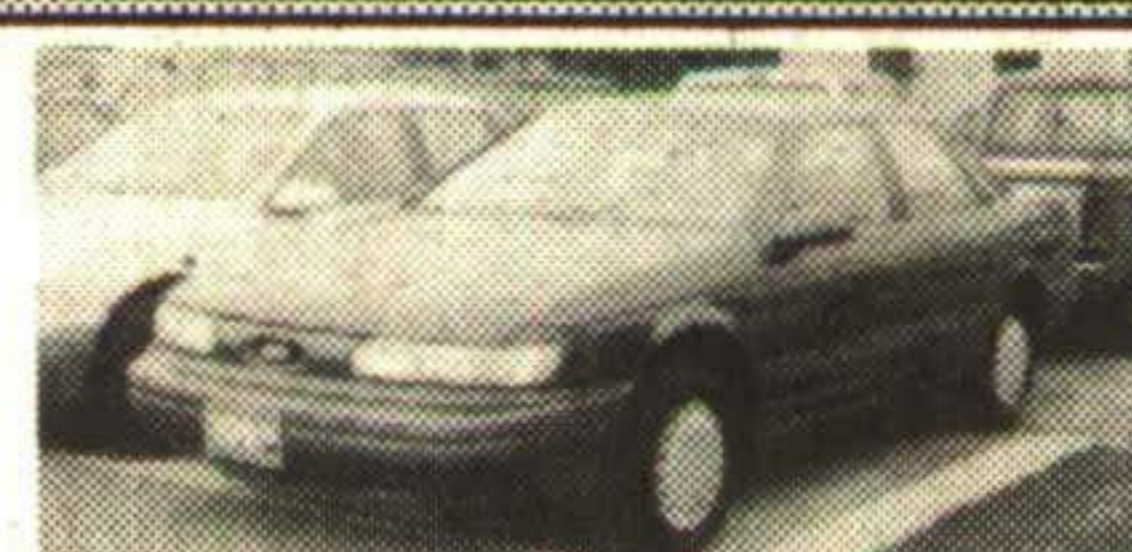
1992 TAURUS L V6, air, auto, AM/FM cassette, power windows. $15,495.