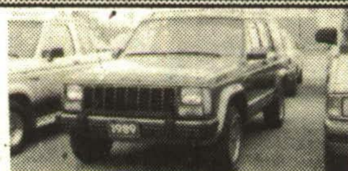
1989 JEEP CHEROKEE LIMITED Loaded! Loaded! Loaded! Incl. leather interior. Stk.#9326 $15,895.