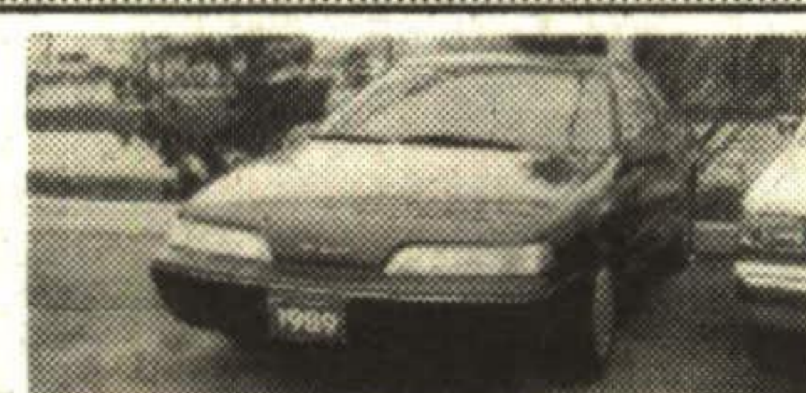
1989 THUNDERBIRD Bucket seats, automatic, power windows & locks, low kms. Stk.#92156 $9,795.