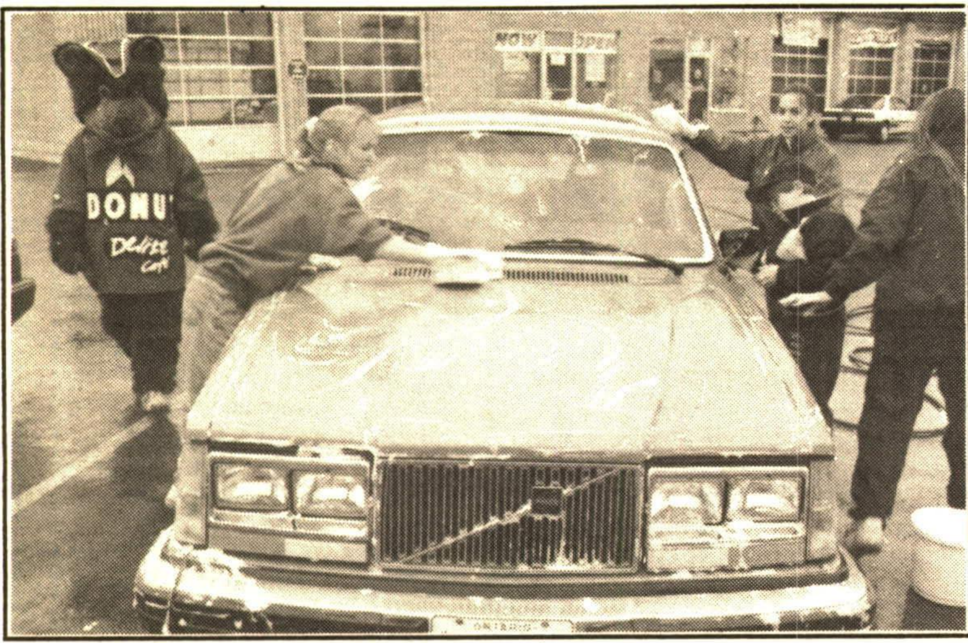
The weather didn't cooperate for a car wash sponsored by Donut Delite, Minit Tune and the Lube Factory on Saturday. Car washers only managed to work for two hours before it started to pour. A total of $78 was raised for the Canadian Cancer Society.