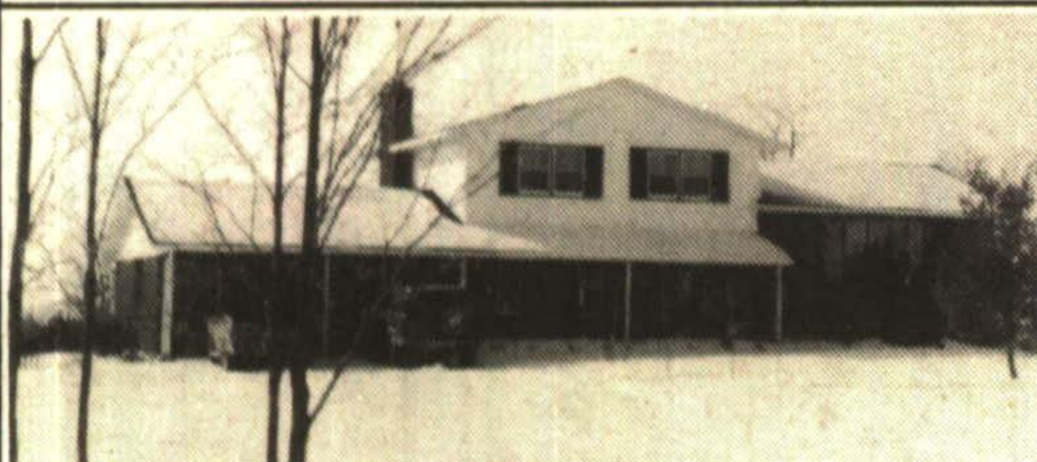
ERIN 1 ACRE $239,900

Exquisite views, beautifully treed lot, less than 15 min. to Georgetown or Acton GO Train. An immaculate home, 4 bedrooms, 2 baths, family room, rec room & garage. Don't wait! MLS. Judy Andrews. 1493