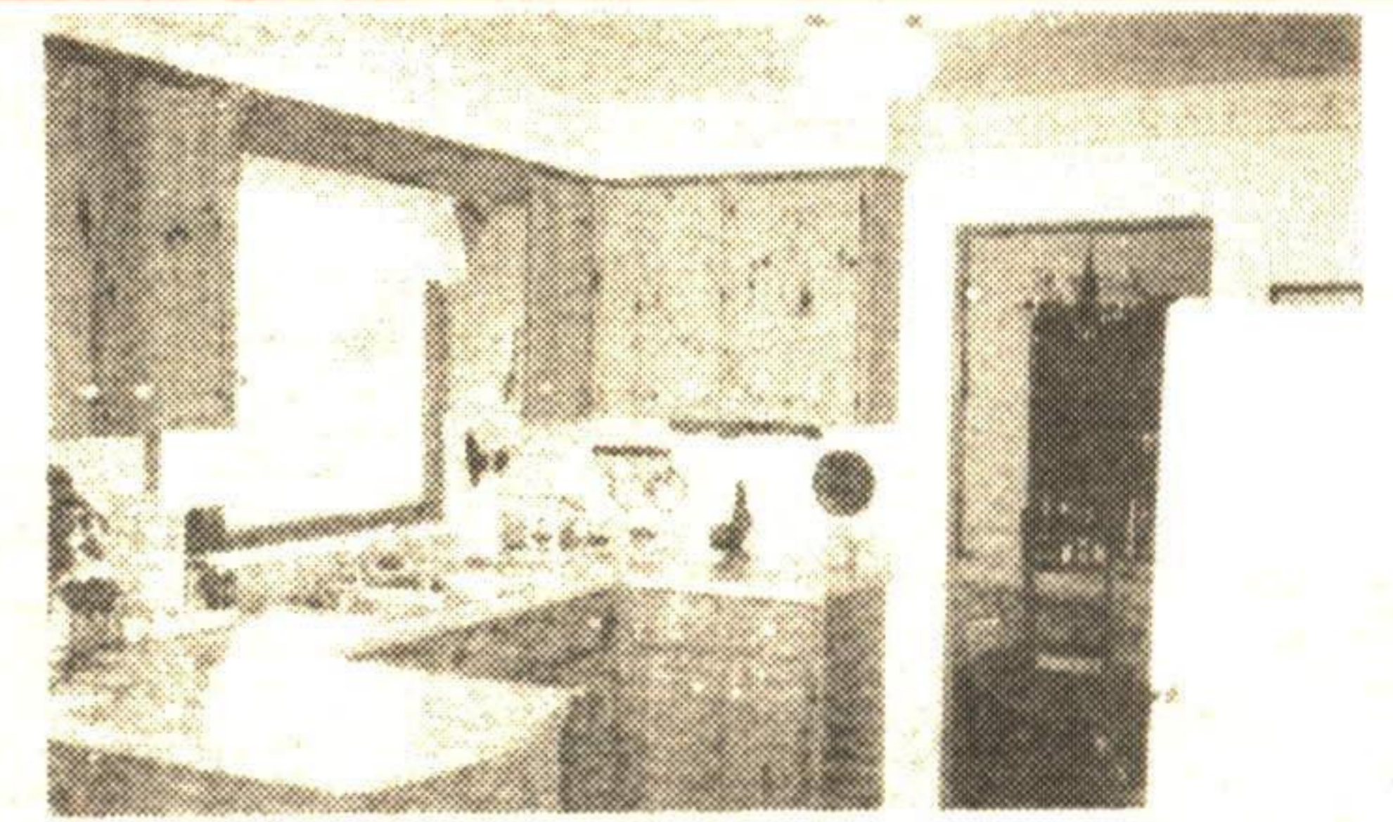
GEORGETOWN WOODED ACRE - $209,000. - PRICED TO SELL!!