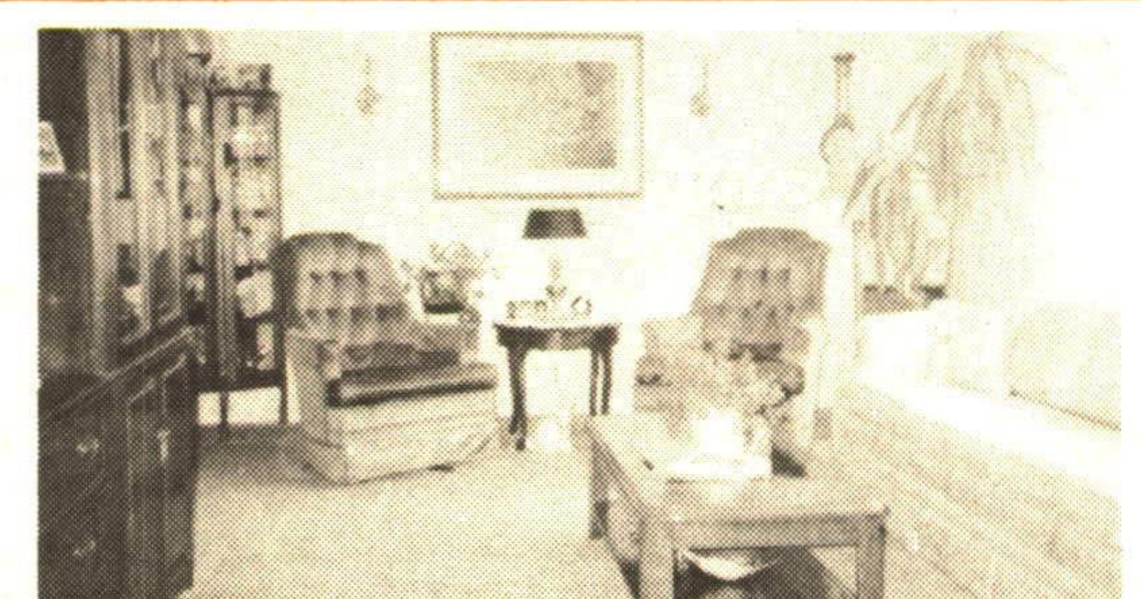
SPECIAL HOME - SPECIAL PRICE - $199,900. - 4 BEDROOMS - INCOME POTENTIAL!!