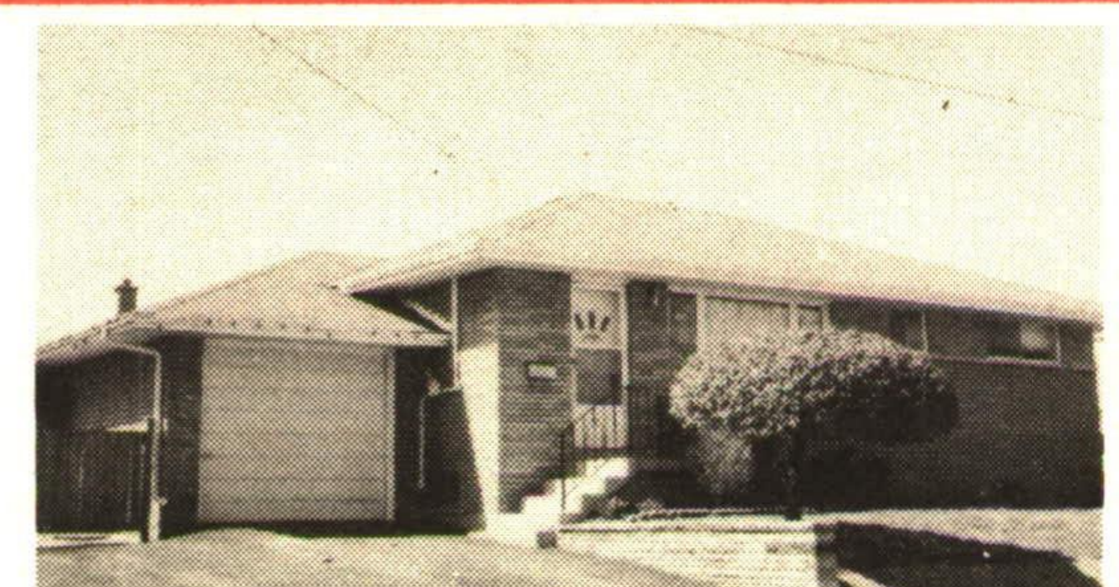
SQUEAKY CLEAN - $165,000 - BRICK & ALUM. - QUIET CRESCENT - 4 BEDROOMS!!