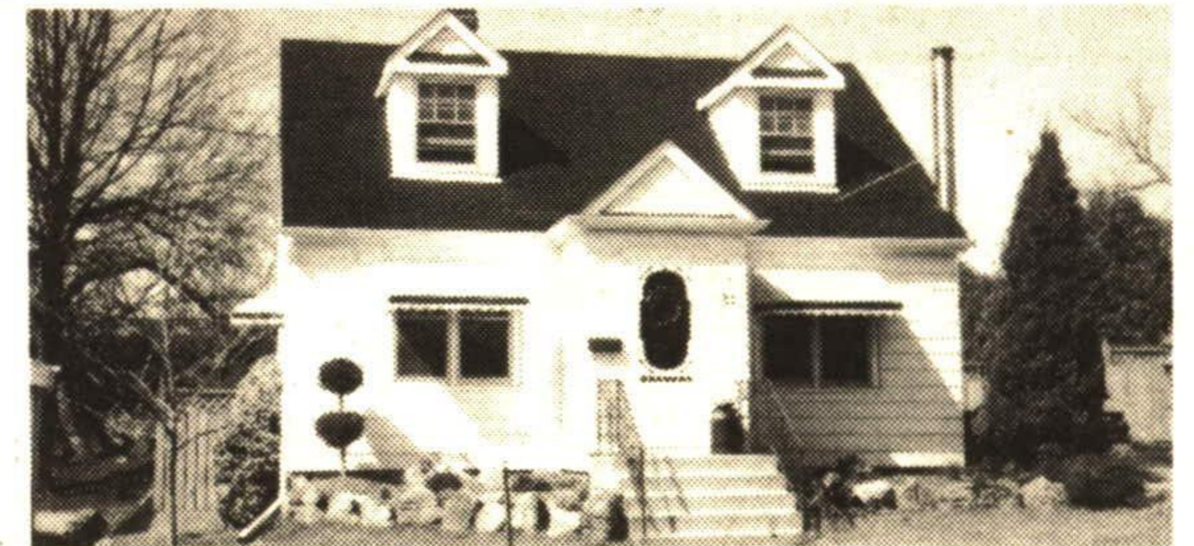
GEORGETOWN PARK AREA - CAPE COD CHARM - REDUCED TO SELL!! $179,900