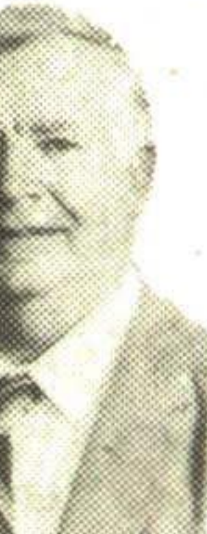
AB GENOE Sales Rep.