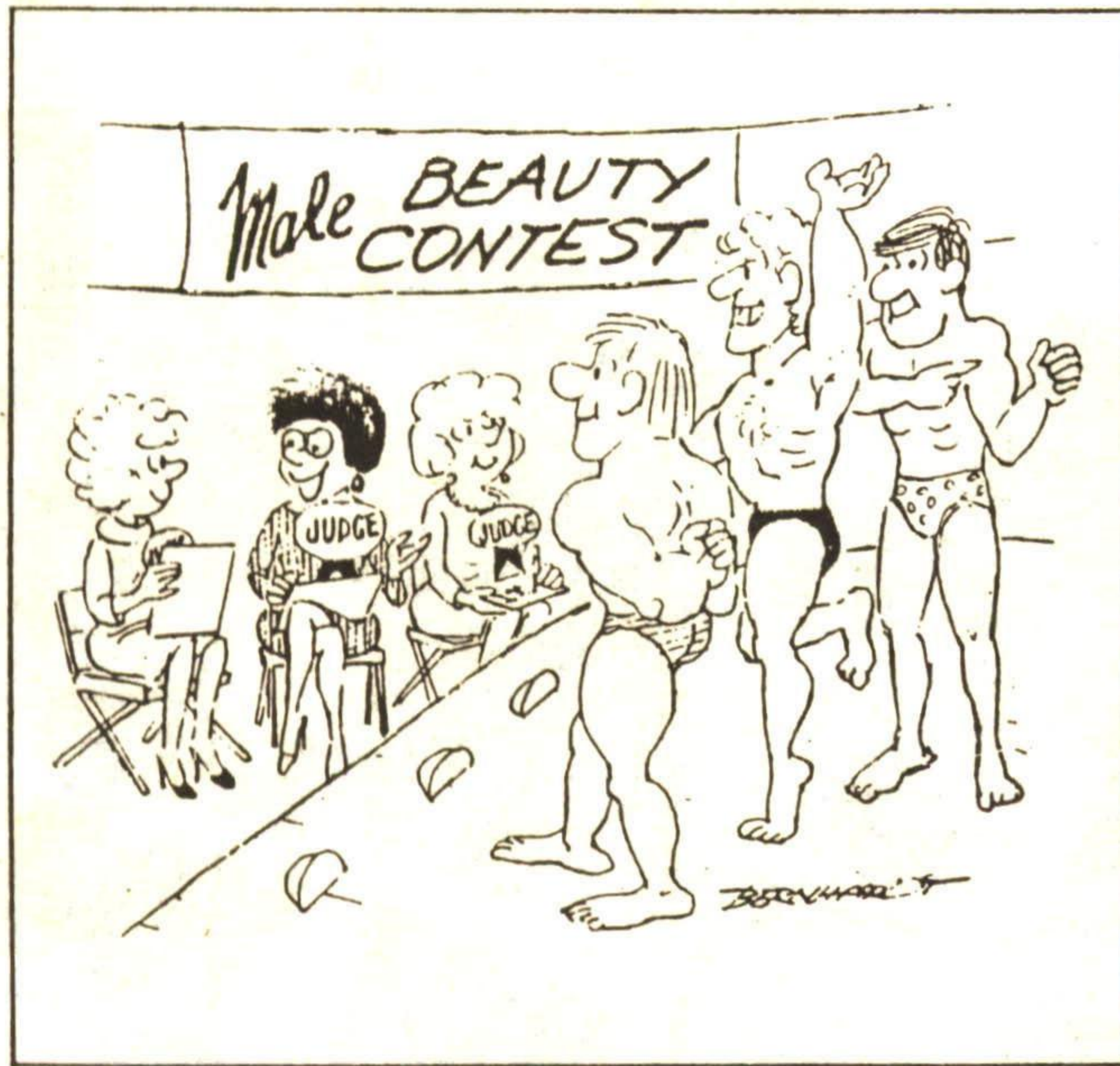
"I used to think beauty contests were chauvinistic, but this is different."